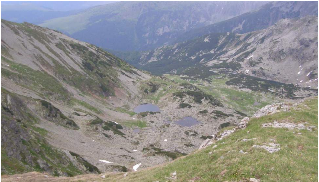
Mija glacial valley, view on the NE-direction from Cârja Peak