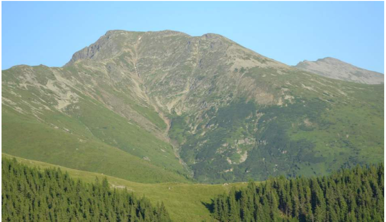
W-oriented slopes below Cârja Peak (2405 m a.s.l.) with vegetation cover affected by debris flow and snow avalanche activity